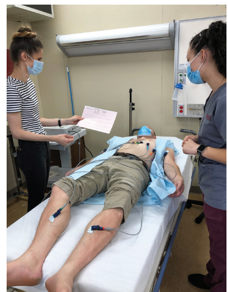
Limited Clinical Skills training in progress – EKG lead placement.