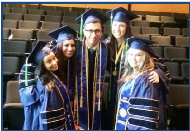
The Class of 2016 at Commencement on May 25, 2016.