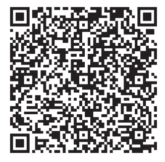
FIGURE 2 Ten Steps for Writing an Exceptional Personal Statement: Digital Tool

medicine, and surgery used an opening that included either a personal narrative (66%) and/or a decision to enter medicine (54%) or the specialty of choice (72%). Radiology PDs ranked personal attributes as the second most important component in personal statements behind choice of specialty. Further, a descriptive study of anesthesia applicants' personal statements ranked those that included elements such as discussion of a family's or friend's illness or a patient case as more original. We feel that personal and patient stories often provide an interesting hook to engage readers, as well as a mechanism to highlight (1) personal characteristics, (2) journey to and/or enthusiasm for desired discipline, and (3) professional