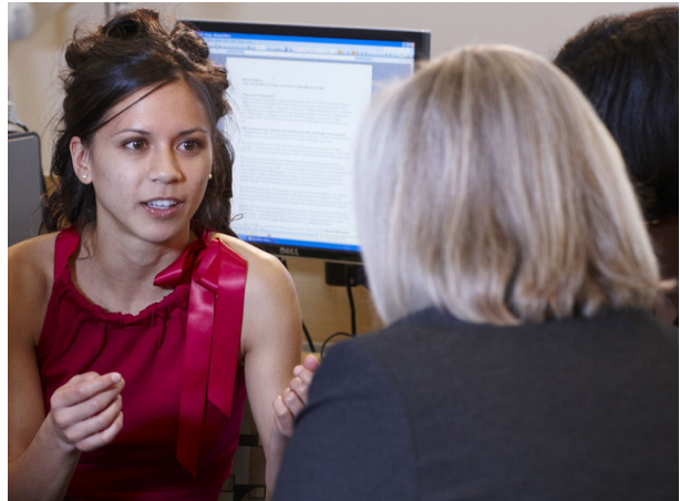
New, state-of-the-art facilities enhance interdisciplinary and interprofessional educational and research programs at the Betty Irene Moore School of Nursing at UC Davis.

The existing Education Building and new graduate studies center will join a possible third integrated health education building in the future to enclose a landscaped quad on the Sacramento campus where education, research and clinical facilities intersect. The quad will lend an academic feeling to the campus, making it a more inviting atmosphere for students.