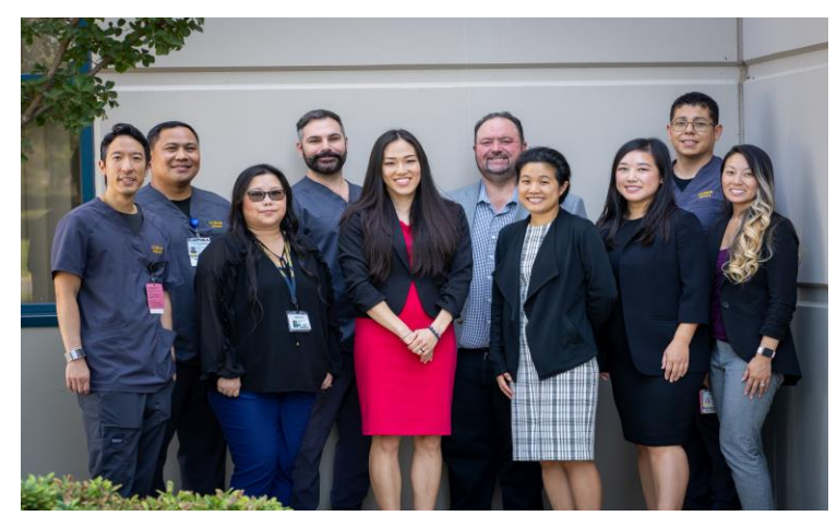
9 New Manufacturer limited distribution drugs acquired