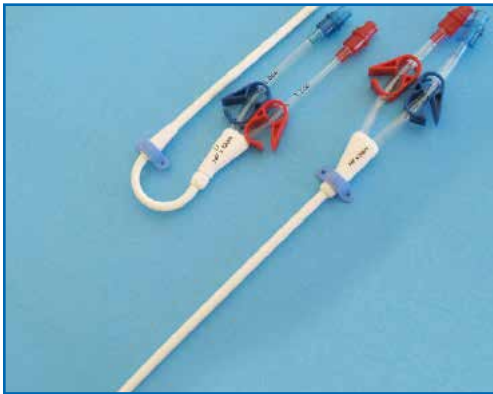
Pictured above is a catheter clamp.

the stitches once the catheter is in place and healed. This will help decrease the risk of a skin infection around the catheter.