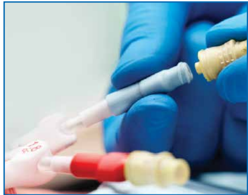
Pictured above is a catheter clamp.

When the cap is off, you could get an infection or air could get into your bloodstream and cause a serious complication. If any part of the catheter develops a hole, leak or part separation you must make sure the catheter is clamped off above the problem area. The catheter clamp may be movable and can be slid up on the body of the catheter to close off the catheter, or you may need to kink the catheter with your fingers to block the catheter and then call 911. If blood leaks out, air can enter and cause an air embolism. You need immediate help to prevent serious injury. Don't worry, your dialysis staff can teach you about all of these things as often as you want.